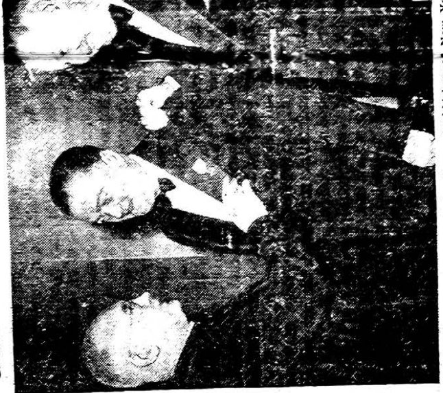
Cardinal-Dignitate Francis J. Spellman, Archbishop of New York presents the 1946 Club of Champions Medal of the Catholic Youth Organization of the New York Archdiocese to FBI Chief, J. Edgar Hoover, for his fight against juvenile delinquency. James A. Farley (right), former Postmaster General of the United States looks on.